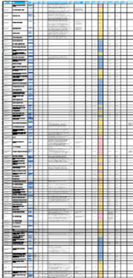
On-Going Scanning For Change

Clutch has developed a streamlined report format to succinctly summarise changes identified.